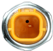
Connector shape for 50-1030, 50-1029, 50-1028, 50-1059, 50-1060, and 50-1061